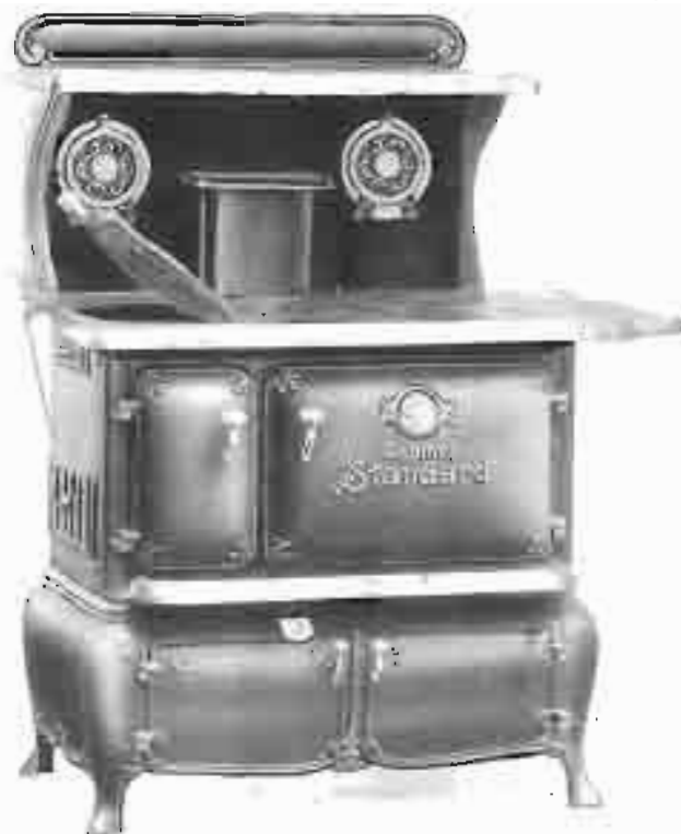
Cabinet Standard with H Mantle