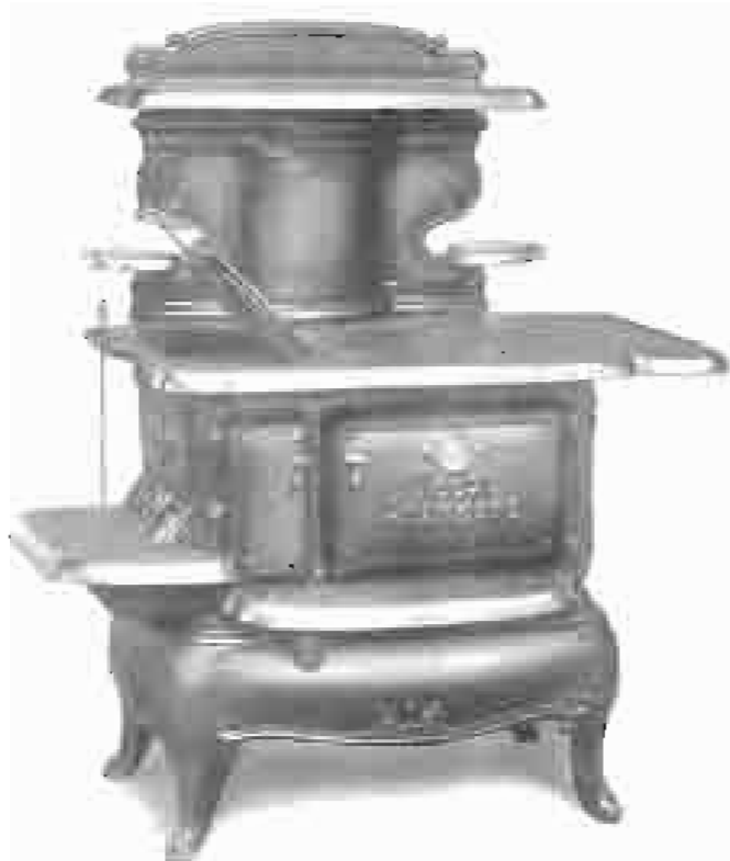
Ideal Standard with E Mantle