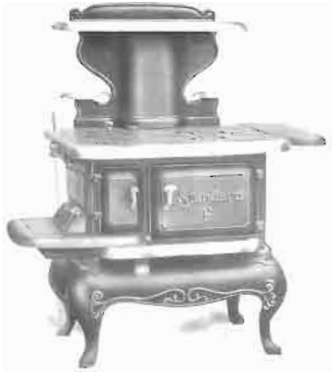
Standard F with K Mantle