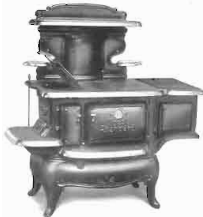
Ideal Standard with Reservoir and E Mantle