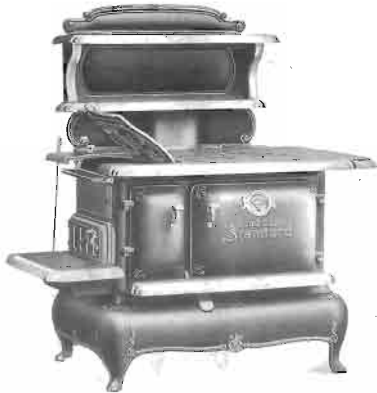
Good Luck Standard with L Mantle