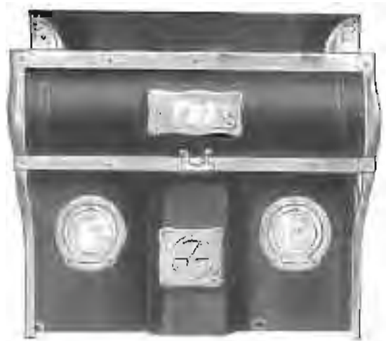
Elevated Steel Oven