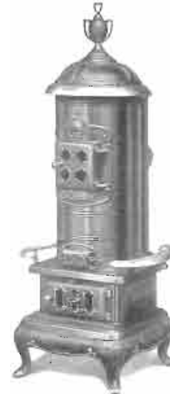
New Standard Parlor

The best camp range made, Made with Slide Damper. A wonderful baker.