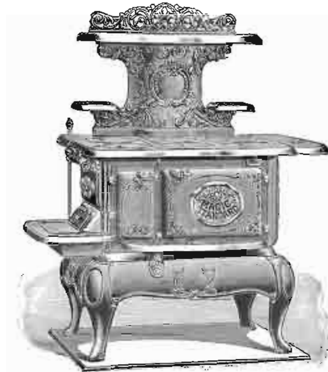
Magic Standard with A Mantle