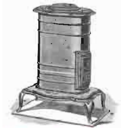
Wood Air Tight

No. 000, 14 in. Wood. Castings... $3.50, Mounted... 5.50