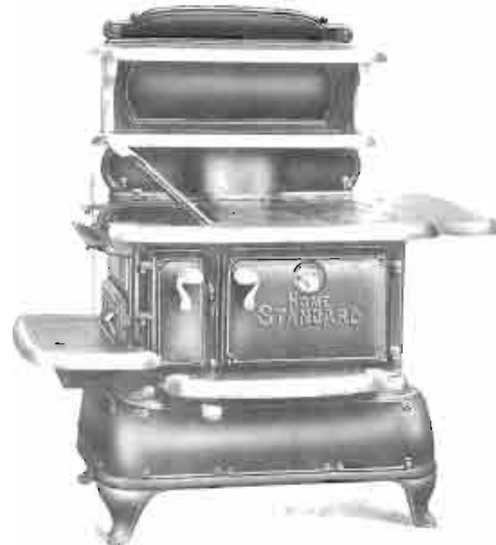
Home Standard with C Mantle