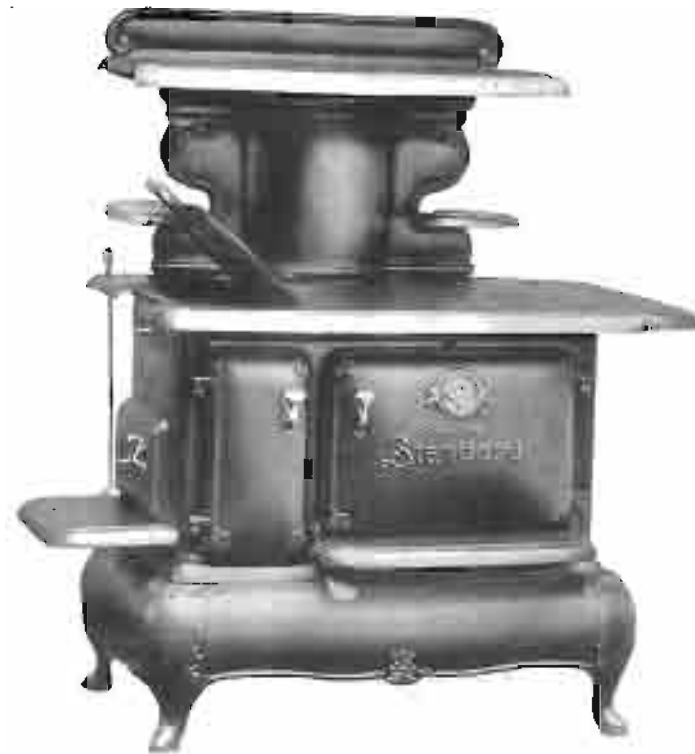
Perfect Standard with G Mantle