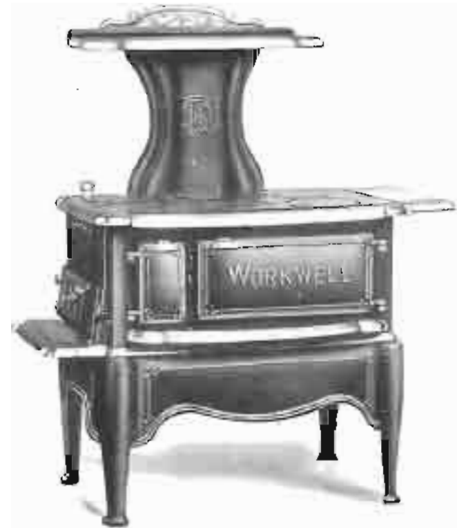
Workwell with Mantle