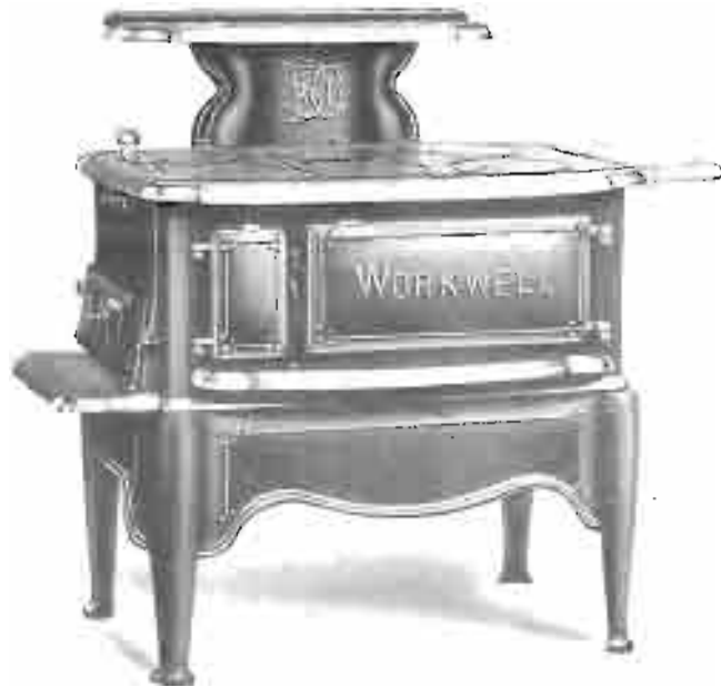
Workwell with Tea Mantle.

The best camp range made, Made with Slide Damper. A wonderful baker.