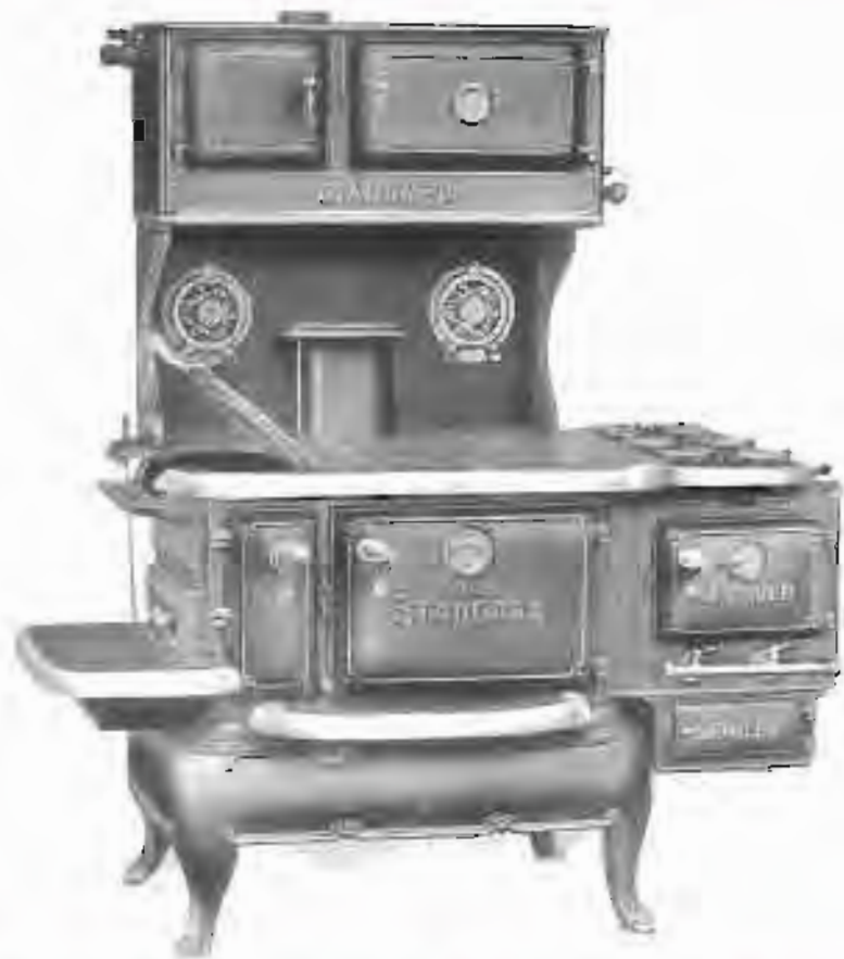
Home Standard with Elevated Gas Oven