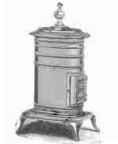
Wood Air Tight

No. 000, 14 in. Wood. Castings... $3.50, Mounted... 5.50