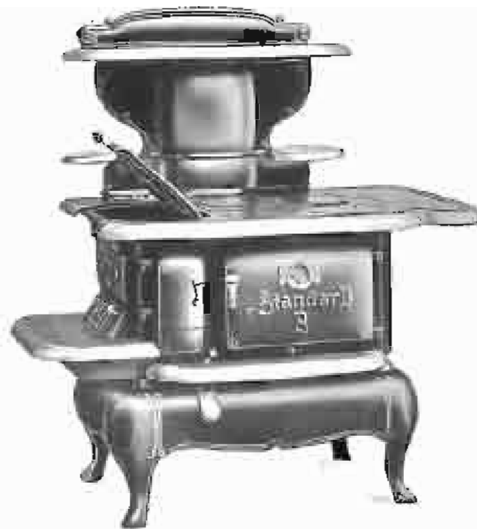
Standard B with J Mantle