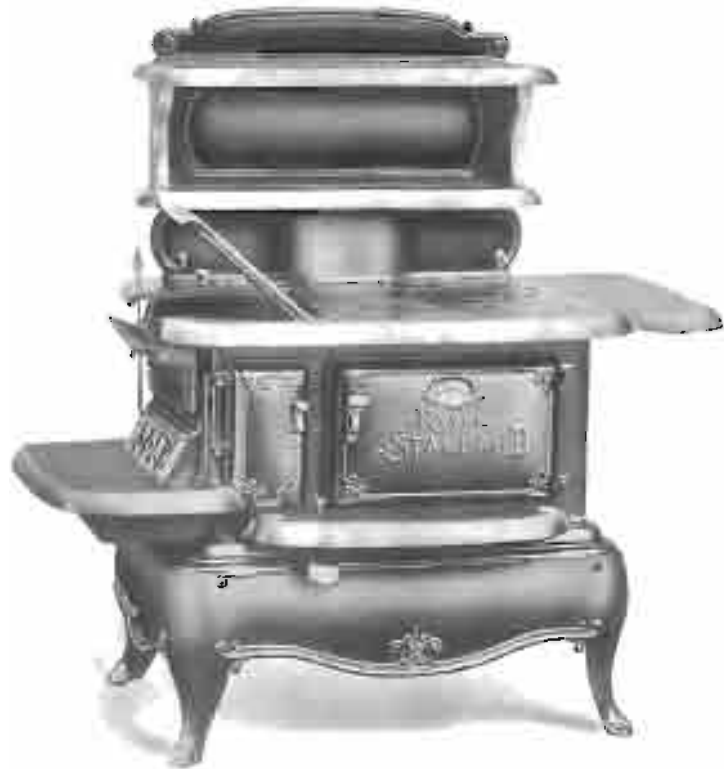
Royal Standard with C Mantle