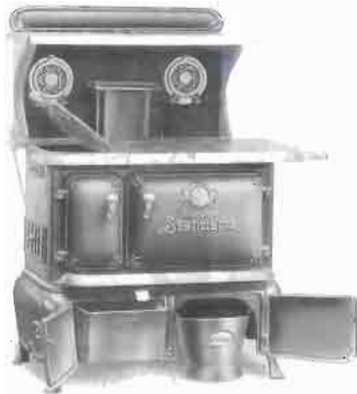
Cabinet Standard with H Mantle